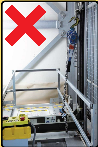
The hook may never be wrapped around the hoist chain.