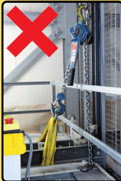
The sling is placed too far away.